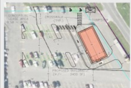
Concept Plan 2 Drive-Thru